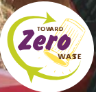
A Toward Zero Waste Event